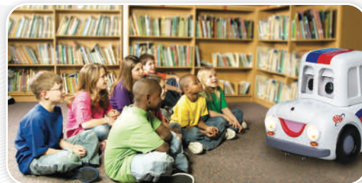
OTTO THE AUTO is an interactive robot who visits schools to teach young children about traffic safety!

We have subject matter experts readily available for interviews in all areas and we can also furnish b-roll, pre-recorded interviews, virtual interviews, photos and social media content upon request.